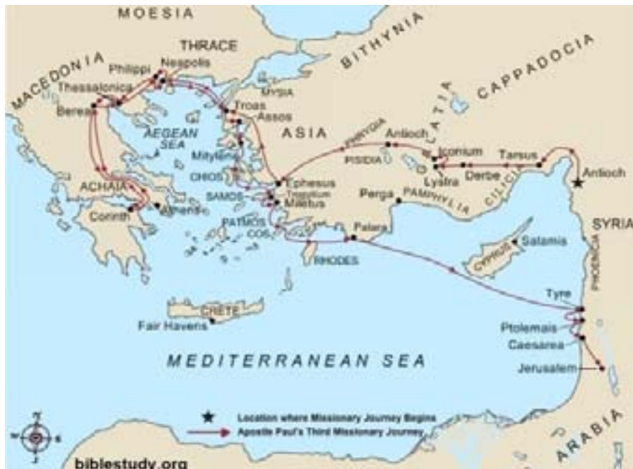
Paul's Third Missionary Journey

Paul's third journey begins in Antioch in Acts 18:23 (54-57?). After traveling throughout the Mediterranean, he returns to Jerusalem only to be arrested by Roman soldiers (Acts 21:17-22:16).