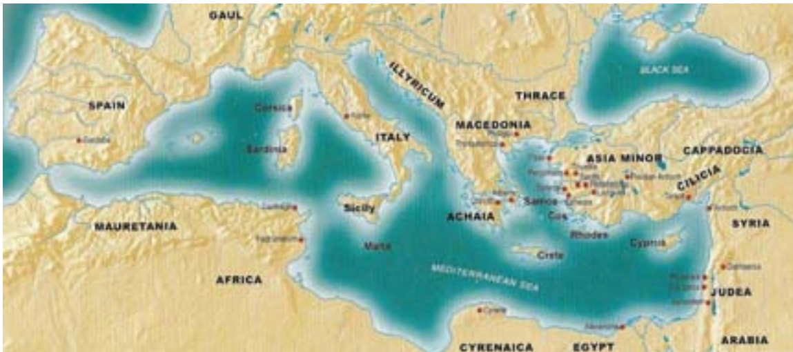
The 1 st Century Roman World