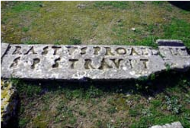
Corinthian Erastus Inscription

In chapter 16, Paul mentions three people that help to identify the letter's composition with Corinth: Phoebe (16:1), Gaius (16:23), and Erastus (16:23). Phoebe was sent by Paul to the church in Rome as the bearer of the epistle. With her being from Cenchrea, she would have had ties to Corinth because Cenchrea is the port city for Corinth. In 1 Cor 1:14, Gaius is referenced as one who lived in