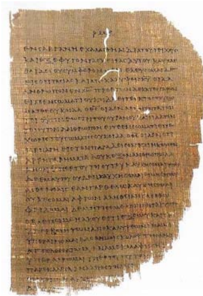
Oldest Surviving Papyrus Fragment of Romans P 46 , Dates to 200 AD

There are several views of the main purpose of Romans. Some think the main reason for the letter is to exhort unity within the church, especially between Jews and Gentiles. Paul's "law-free" Gospel had achieved a certain degree of notoriety which created issues with the Jewish Christians. Others think that the letter is written to address the need for an apostolic foundation. Romans is the only letter we have where Paul is writing to a church he didn't begin. Still others see Romans as a "carefully planned, doctrinal presentation of the Christian faith." Yet the epistle is lacking in such key elements of Pauline doctrine like eschatology, Christology, the Lord's Supper and church order. Others see a key reason being that Paul is seeking support from the Romans for his planned mission to Spain (Rom 15:23).