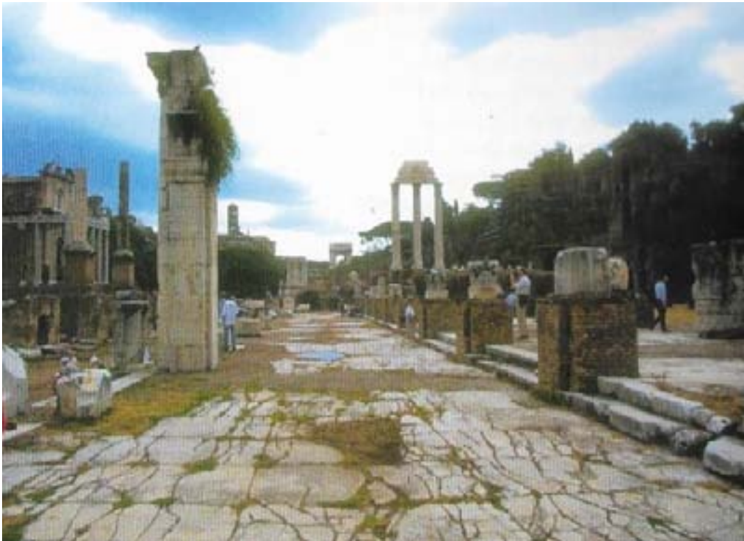
Remains of the Forum in Rome

It is thought that Paul wrote this letter in the mid-50s from the city of Corinth, while on his third missionary journey (54-57?). At the time, he was gathering an offering from the Gentile Christians for the church in Jerusalem (15:25; Acts 24:17).