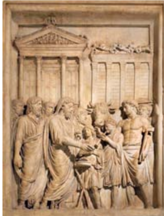
Marcus Aurelius sacrificing at the Temple of Jupiter