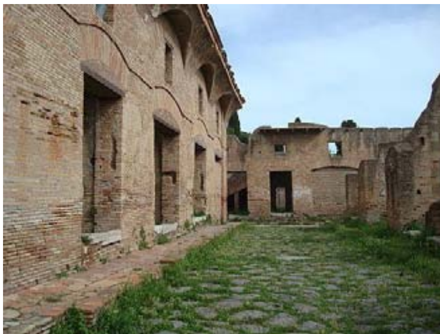
Remains of an ancient Roman apartment building