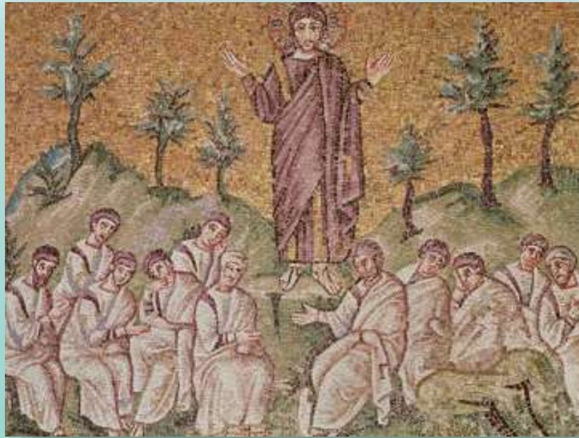
The Sermon on the Mount Mosaic Byzantine School (6 th Century)

“The Sum of the Christian Life” John Chrysostom