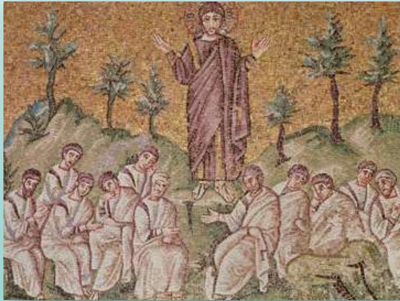
The Sermon on the Mount Mosaic Byzantine School (6 th Century)

“The Sum of the Christian Life” John Chrysostom