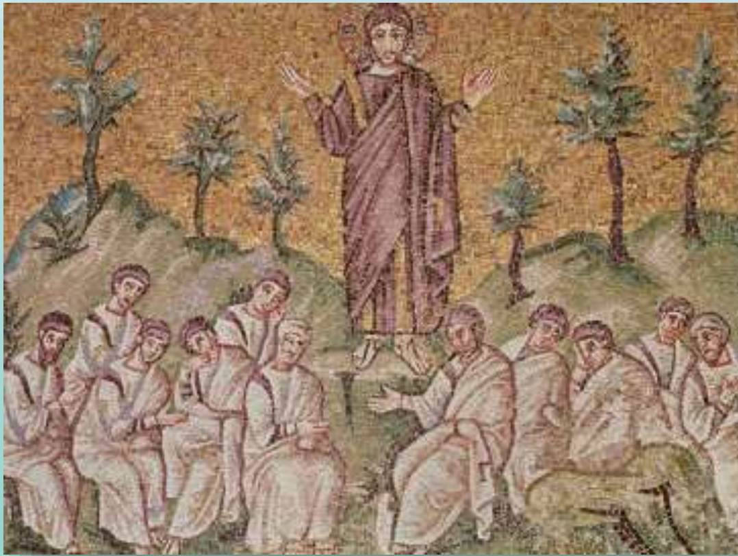
The Sermon on the Mount Mosaic Byzantine School (6 th Century)