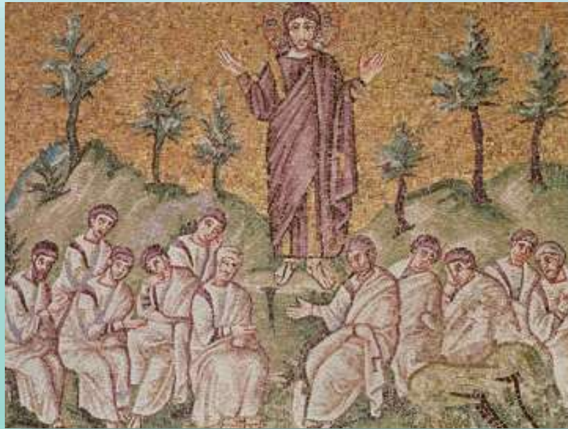
The Sermon on the Mount Mosaic Byzantine School (6 th Century)

“The Sum of the Christian Life” John Chrysostom