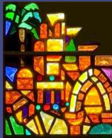
The Kingdom of God