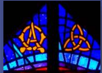
The God of the Kingdom