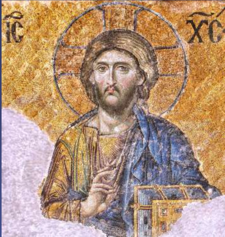
Christ Pantocrator (“ Almighty ”) Hagia Sophia, Istanbul, Turkey, 13 th Century