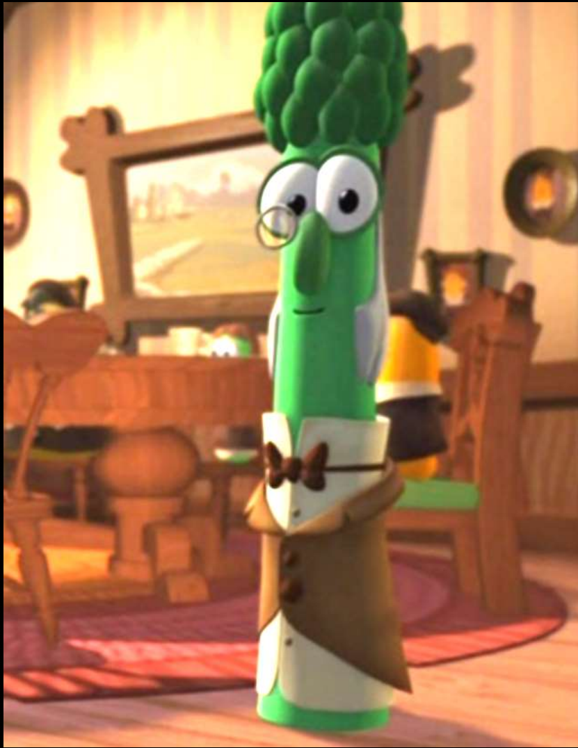
George Mueller 1805-1898