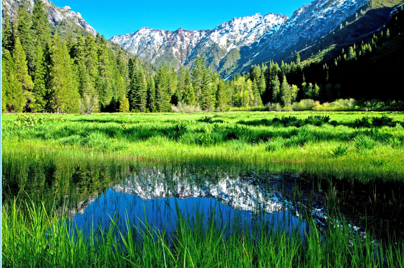
Trinity Alps Wilderness