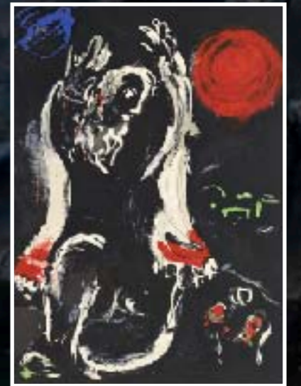
Chagall ~ Isaiah