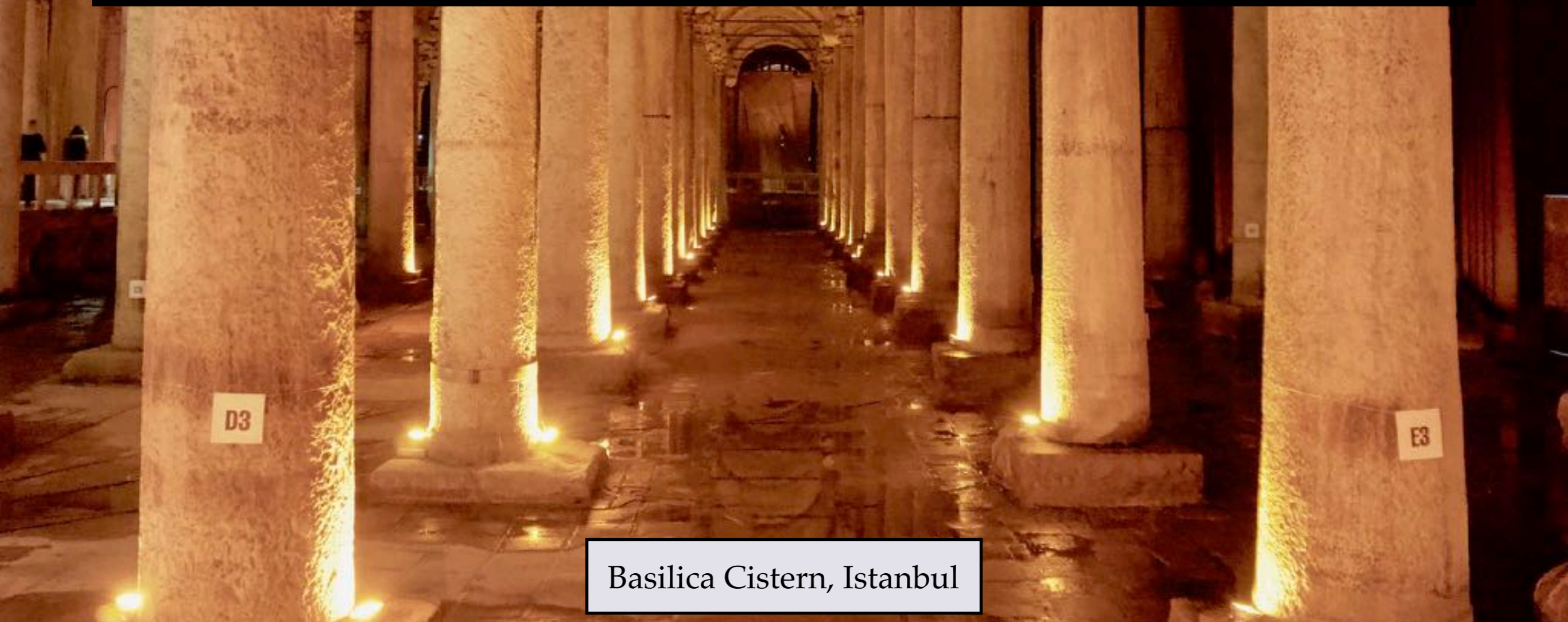
Basilica Cistern, Istanbul